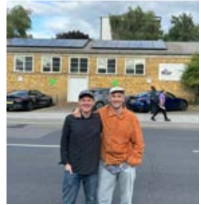
Our members join us from an early age ▼