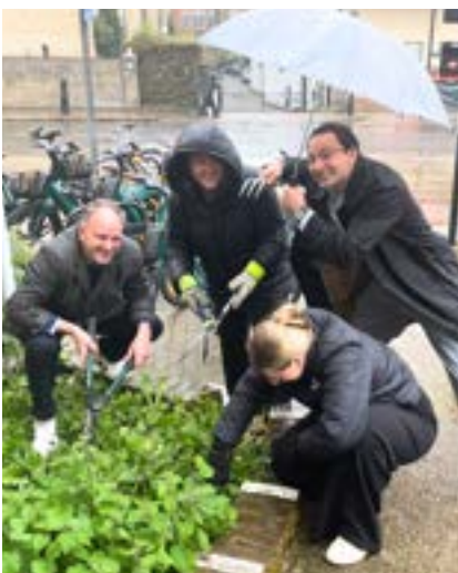
◀ The garden areas got a clear out, and Climate Centre showed off their green fingers