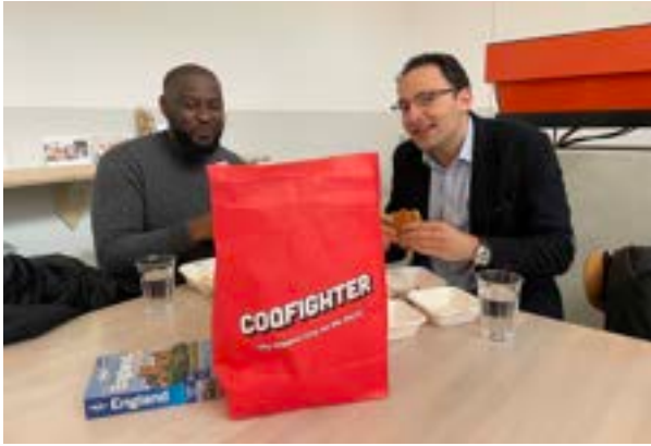
◀ Lunchtimes in ARK